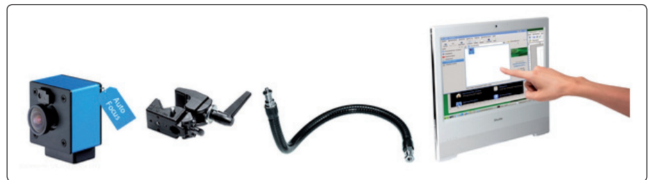
System components: camera, flexi-arm, cable and touch screen

Application areas are remote or dangerous locations, milling machines and solder stations.